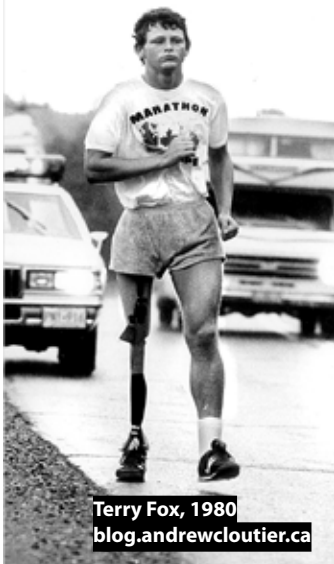
Terry Fox, 1980

Terry Fox is a Canadian hero. At the age of 22, having lost one leg to cancer, he decided to run across Canada to raise money and awareness for cancer. Each day he ran a marathon, 42 km.