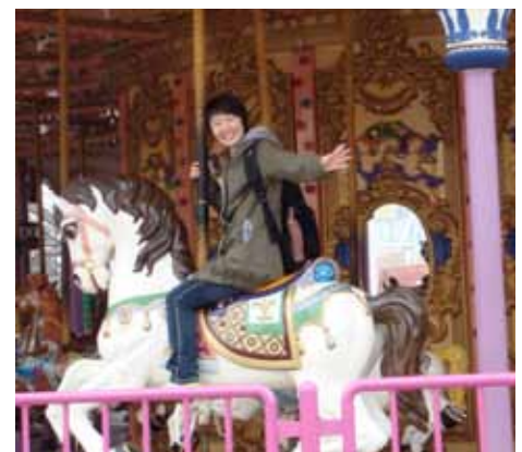
No cleaning up after this horse!