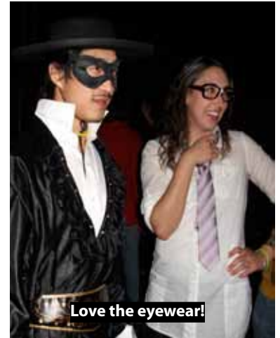
Love the eyewear!

It was really a meaningful celebration to all of us. We not only got to experience a bit of western culture, but we also were able to offer our help to those people who need it. All of us were definitely impressed. Thanks to everyone for their participation and support. ●