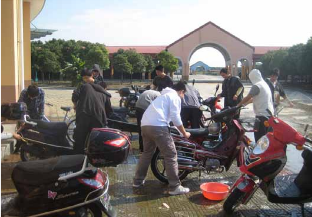
All the boys pitch in to make quick work of the job.