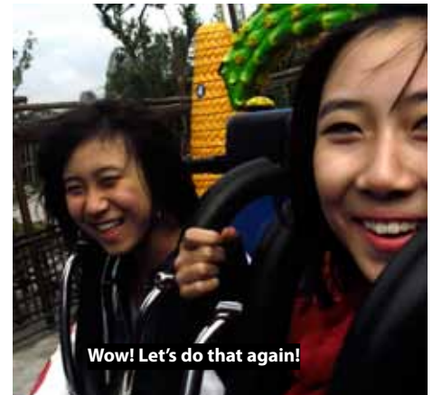
Wow! Let's do that again!