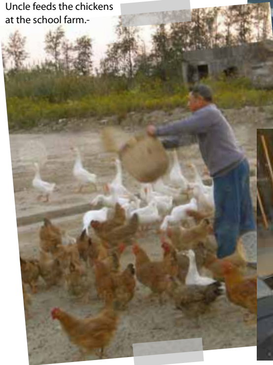
Uncle feeds the chickens at the school farm.-