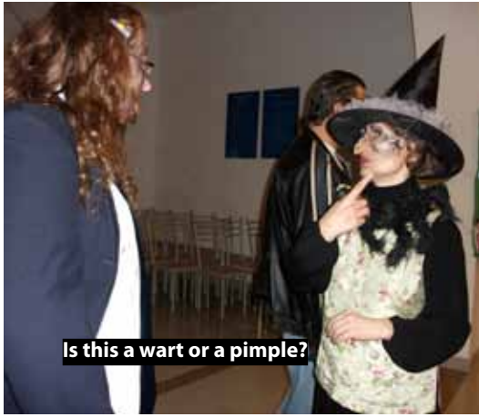
Is this a wart or a pimple?