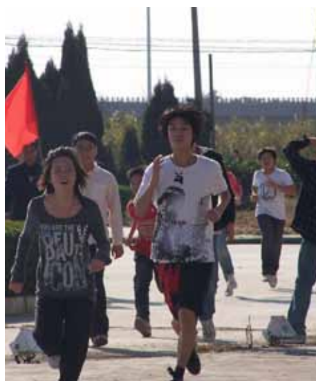
Nearing the finish line