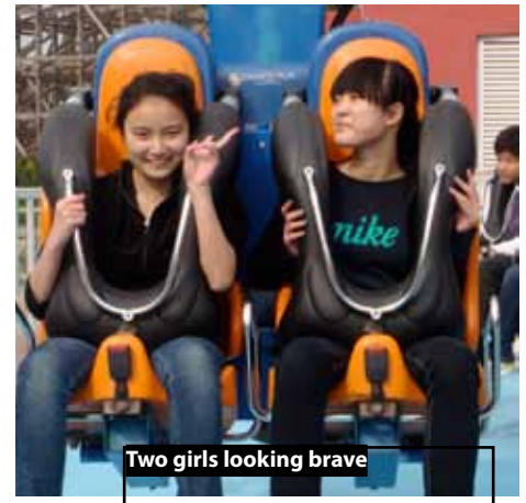
Two girls looking brave