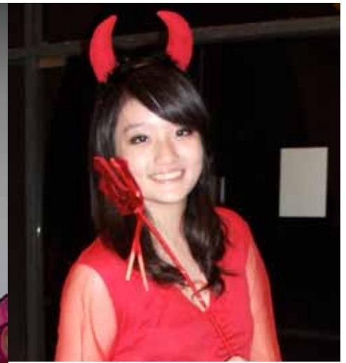
These girls get in the "spirit" of the evening with their costumes.

On Thursday, October 28, students of Sino-Canada High School celebrated Halloween at a party organized by a group of senior students. It was an enjoyable way to learn about a favorite western festival. The weather was cold but could not stop students' enthusiasm.