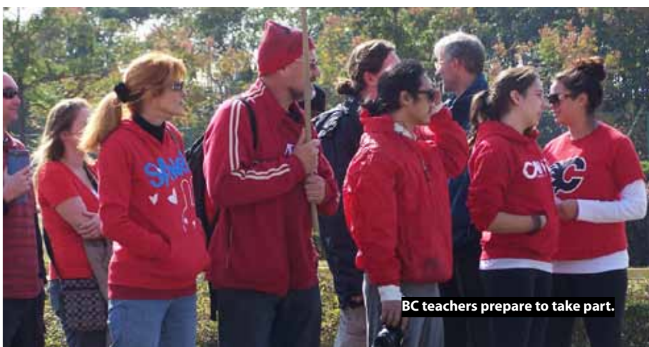
BC teachers prepare to take part.