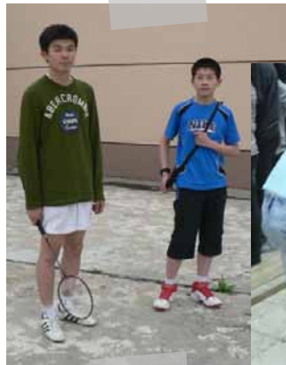
Going to play badminton