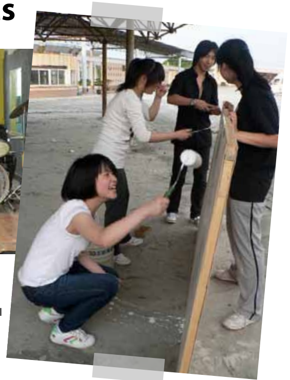
Building sets for the musical