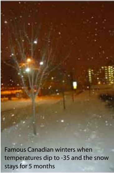
Famous Canadian winters when temperatures dip to -35 and the snow stays for 5 months