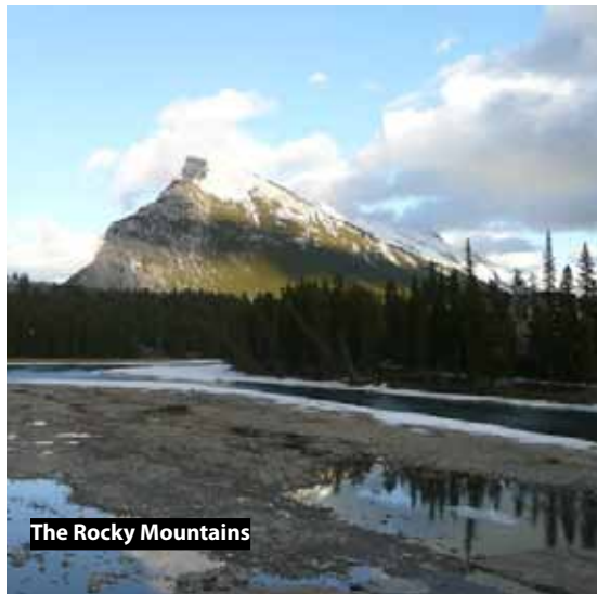
The Rocky Mountains

culture in the west but the sleep deprivation made it hard for me to focus on my studies. Then, I moved out after one month.