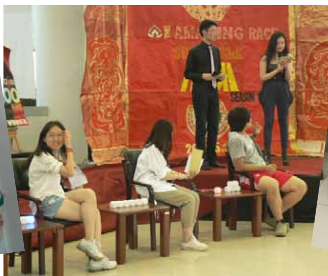
The final round of Sino Rush