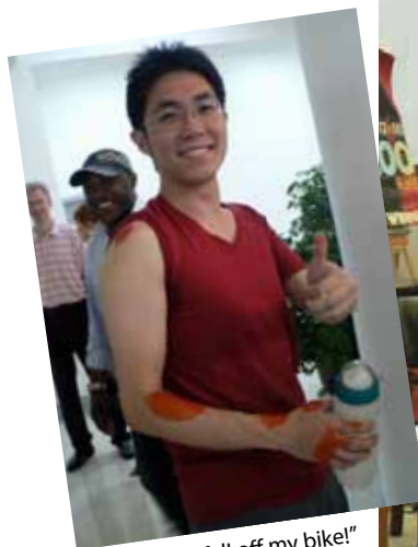
"Owie! I fell off my bike!"