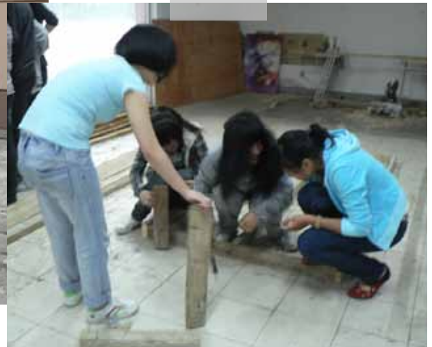
“You say this is a nail and I do what with it?”