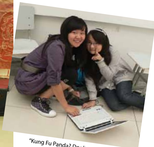
"Kung Fu Panda? Don't tell anyone. We're supposed to be studying!"