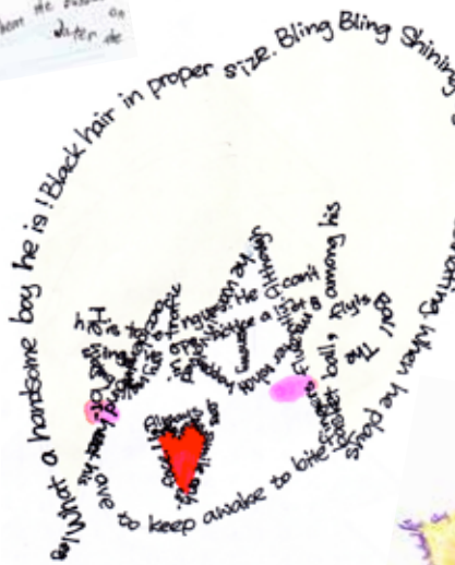
"A Shining Star" by Shirley.