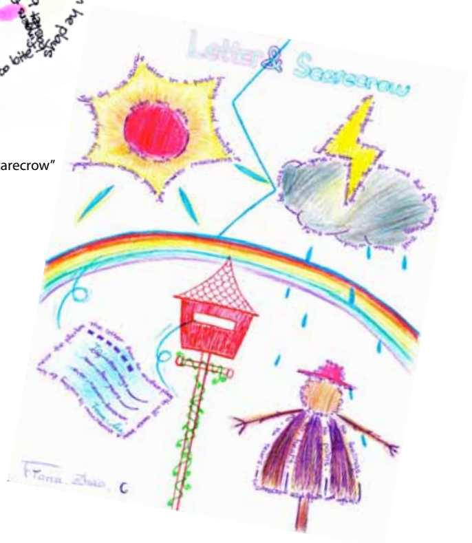
"Letter and Scarecrow" by Fiona Z.