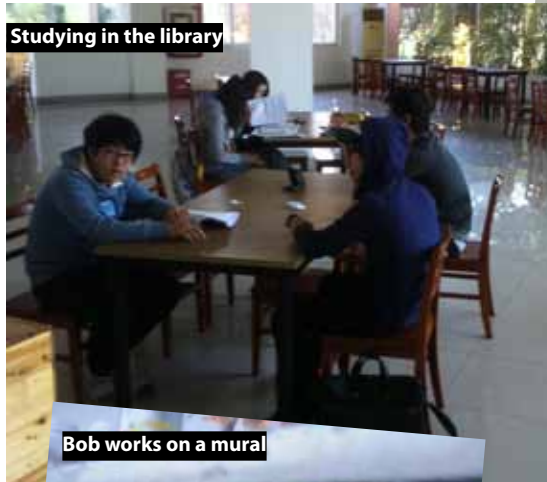
Studying in the library