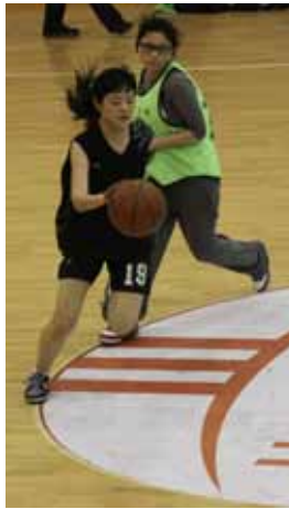
The girls played their first game at Nanyang and came away with a victory. We wish the team well in the remainder of their season. Way to go, girls!