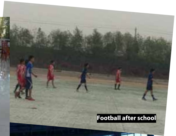
Football after school