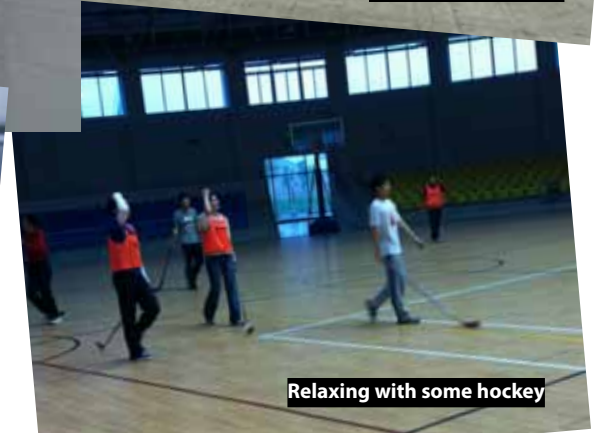
Relaxing with some hockey