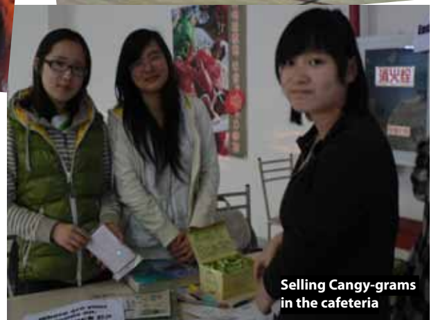
Selling Cangy-grams in the cafeteria